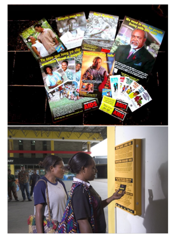
Figure 1: Examples of Some of the 1.1 Million Community Media Resources Promoting Monogamy, Stigma Reduction and Information on Aspects of HIV/AIDS Distributed Across PNG During the 5-Year Term of the Communication Strategy, Including Design Manufacture and Placement Dispensing Units for Distribution of Generic Free Condoms In High-Risk Settings

During the early phases of the strategy, where the requirement was for rapid escalation of HIV/AIDS awareness to stem the tide of infection, more than 350,000 publications, as well as 1800 audio-visuals, and numerous other resources were distributed to Provinces around PNG to support community advocacy, prevention and care activities. Additionally, as the condom social marketing (CSM) component of the strategy evolved in phases3-5 of the strategy almost 12 million condoms were produced and disseminated around the country(See Figure 1).