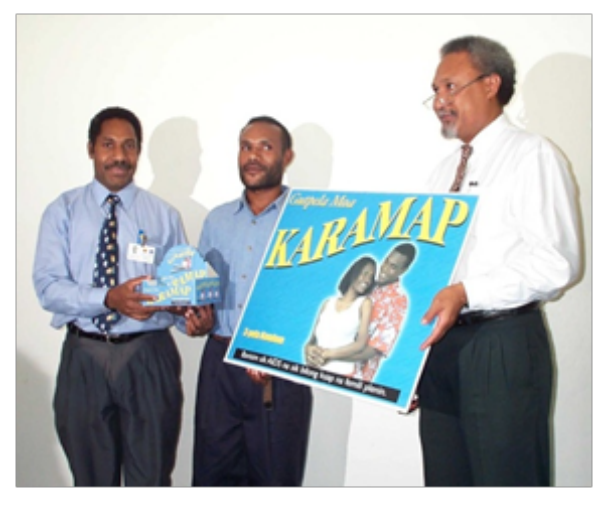
Figure 2. Launch of Karamap Condom brand by the Health Secretary and Director PNG AIDS Council, and Promotional poster for "Long John Strong" High-Risk Males' Generic Condoms